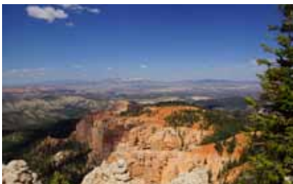
Bryce Canyon - Rainbow Point