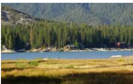
Lake at Oakhurst