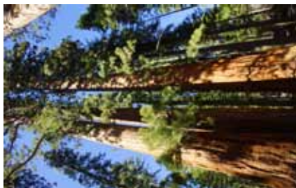
Mariposa Grove - Sequios

The ocean fog was down and the wind bitterly cold for a July day. We explored the city in trolley cars up and down those quite unique streets and all the time looking back to see if we could see "the Bridge". A harbour cruise over to Sausalito was a highlight with amazing food and buildings.