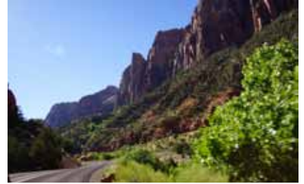
Zion - Mount Carmel Highway