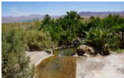
Desert Springs to Lake Mead