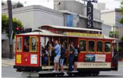
San Fran Trolley Car