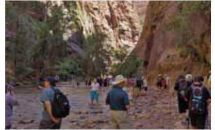
Zion - The Narrows with thousands