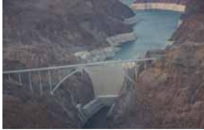
Grand Canyon Hoover Dam