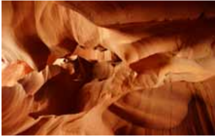
Antelope Canyon (below)