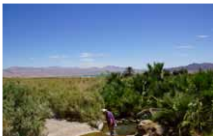
Desert Springs to Lake Mead

We were to experience our first taste of American Aviation flying from SF to Las Vegas. Sitting in the terminal we watched mesmerized at the endless stream of jets, big, small, private and commercial take off in a continuous stream on dual runways. A total of approximately 15 bags was checked through and loaded and the rest as hand luggage in the over head lockers, with dogs on the floor and or in bags throughout the cabin. Certainly an eye opener and that included the ticketing system and standby fares.