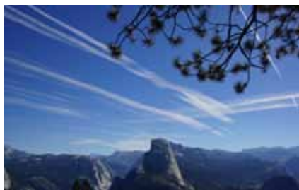
Galcier Point - Yosemite