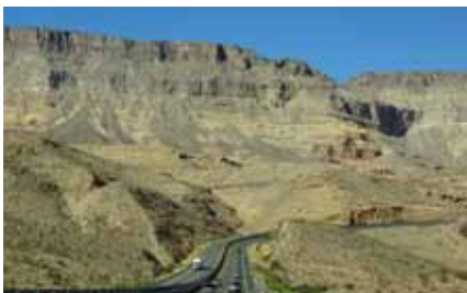
Following Virgin River to Springvale