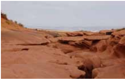
Antelope Canyon (above)