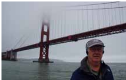
San Francisco - Golden Gate Bridge