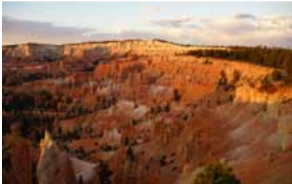
Bryce Canyon Sunrise